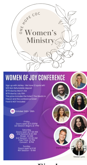
Final payments due July 15th

Every Friday Morning 6 AM in the Coffee Shop is a Men's Bible study that meets and has coffee and dives into a book of the bible.