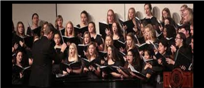
LCU Chorus Christmas Concert December 10 at 6:00pm.